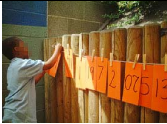
The outdoor curriculum covers all the areas of learning including mathematical development.

Comet has just received an excellent Ofsted Inspection Report. Congratulations to all concerned – practitioners, children and parents.