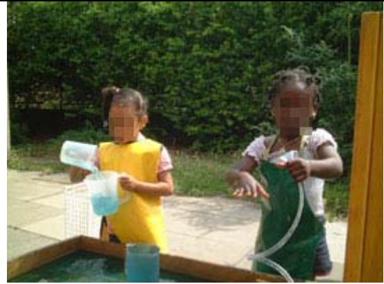
These two girls are concentrating on a water task.