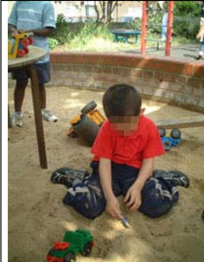
Young children love playing with sand - they may choose to be alone, or be alongside others or cooperate as they talk about their ideas and feelings.