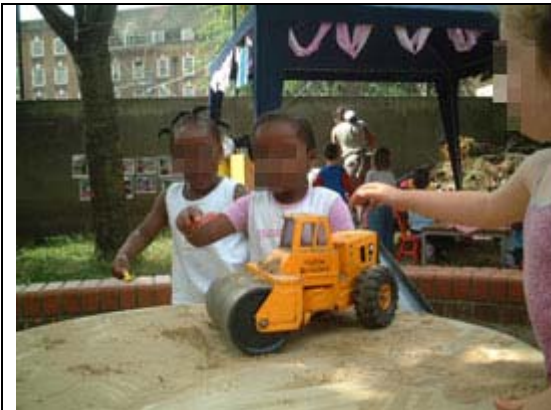
These children are using sand to help create the conditions on a building site – there is a lot of redevelopment work going on around the nursery which they have seen.