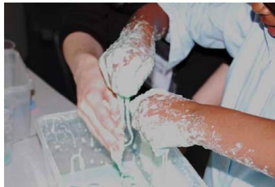
Children enjoying exploring different materials