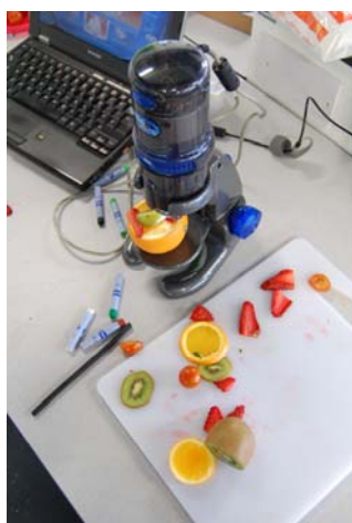
Making close observations