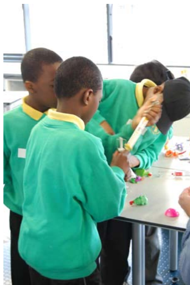
Measuring the force to pop out a toy's tongue