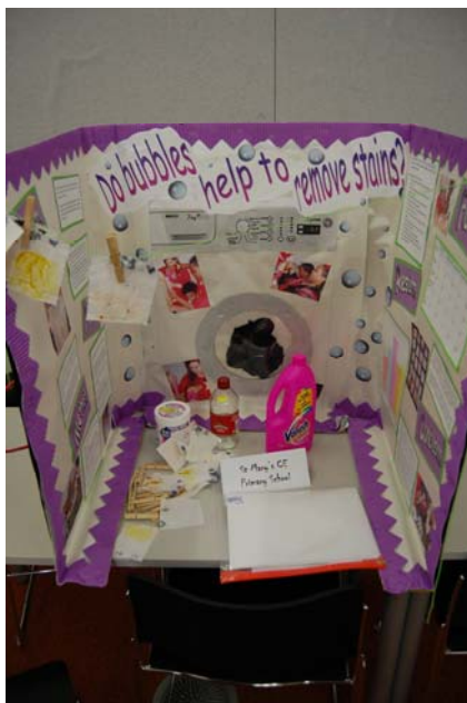
Project work from year 5/6 children at St Mary's

Everyone involved had a great time as you can see from the photographs.